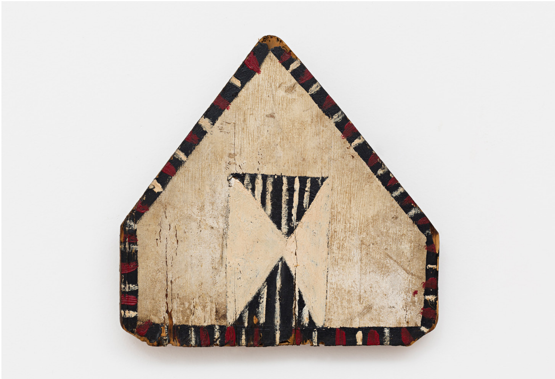
Celso Renato, Untitled , undated, acrylic on wood, 23 × 22 × 4 cm