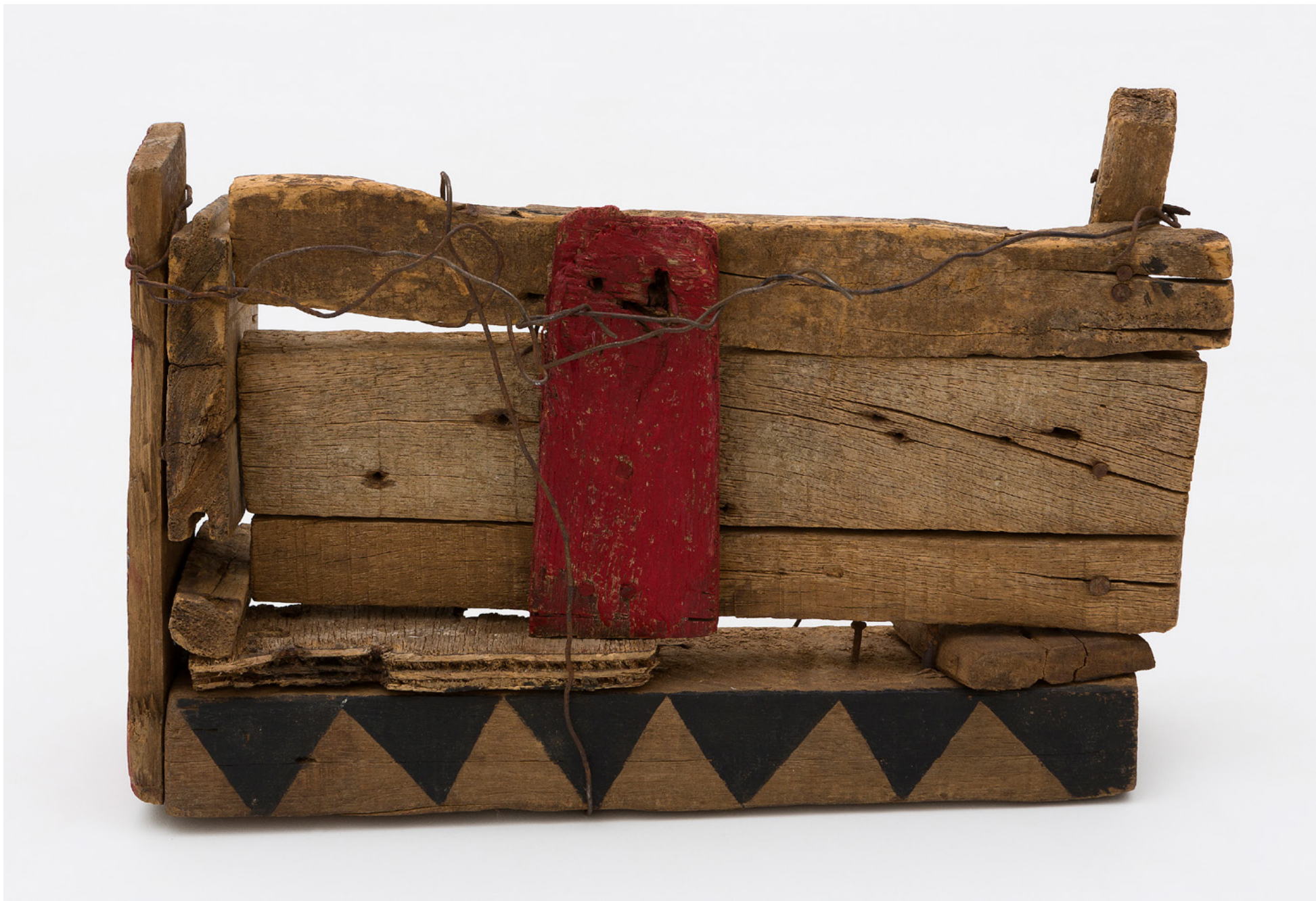
Celso Renato, Fragmentos , undated, wood painted with acrylic paint, 33 × 21 × 10 cm, MW.CRT.S.017