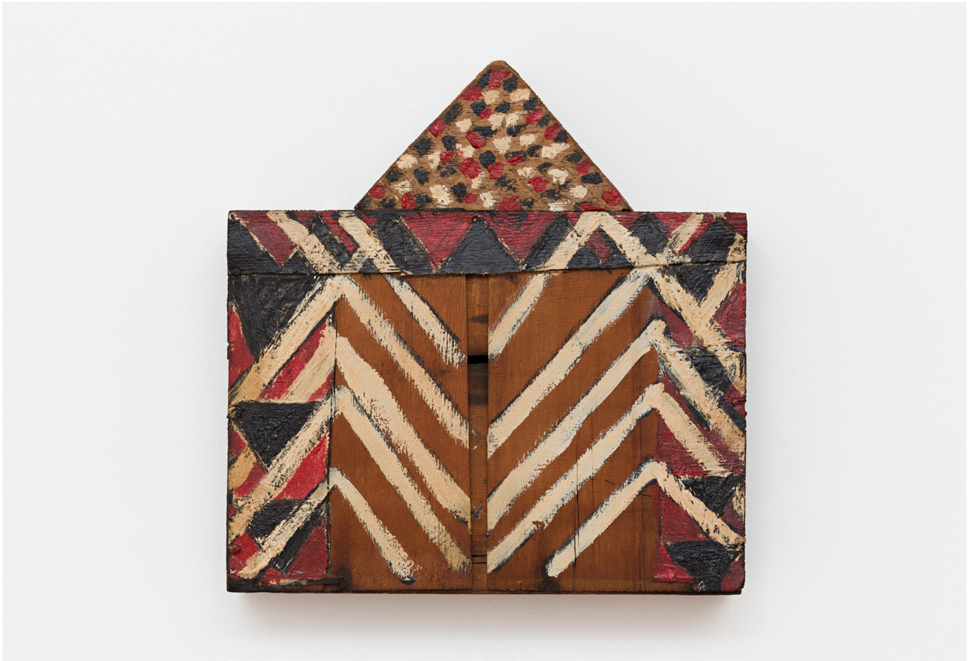
Celso Renato, Untitled , undated, acrylic on wood, 23 × 22 × 4 cm, MW.CRT.P.002