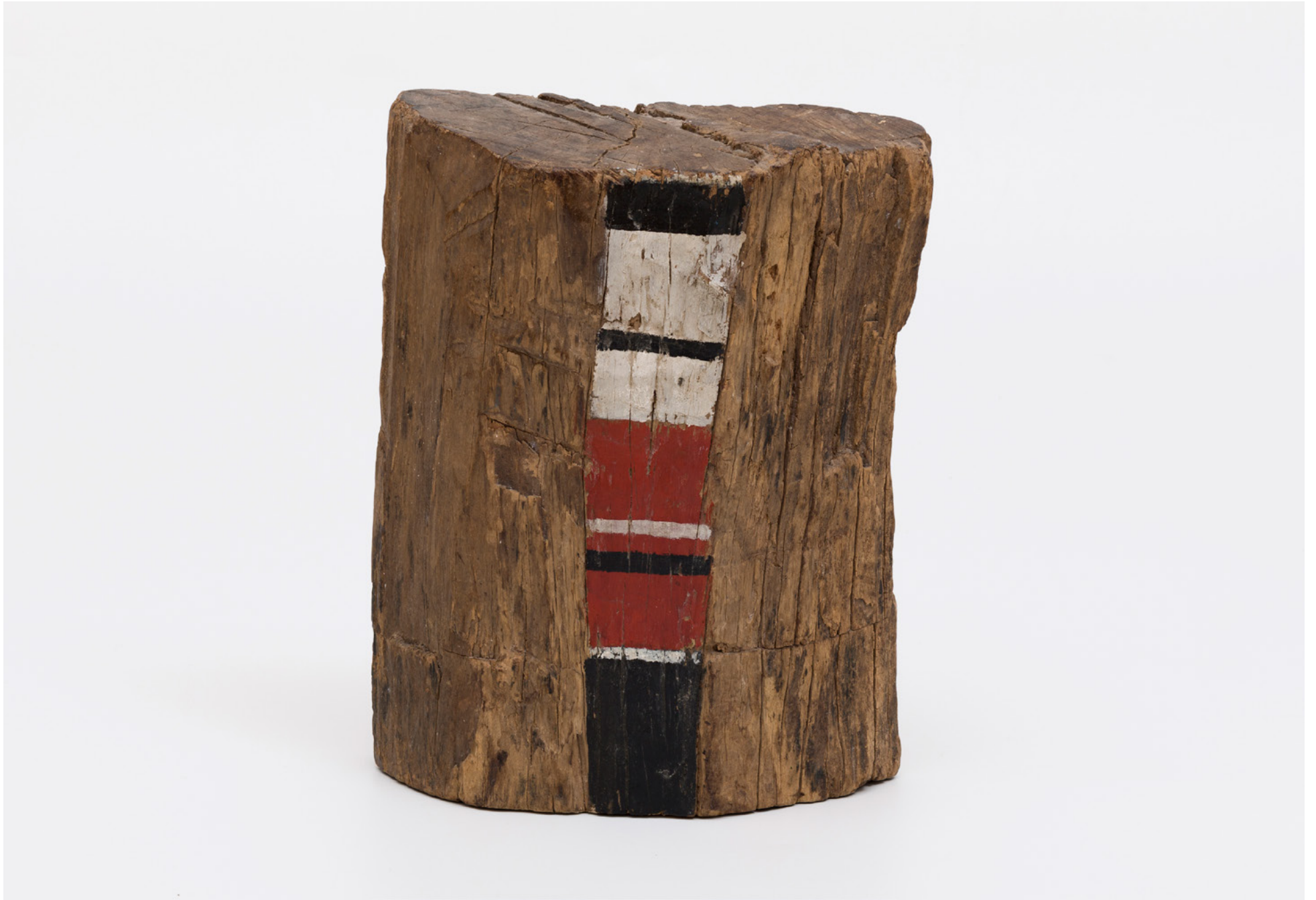
Celso Renato, Untitled , 1988, painting on wood, 22 × 30 × 9 cm, MW.CRT.P.014