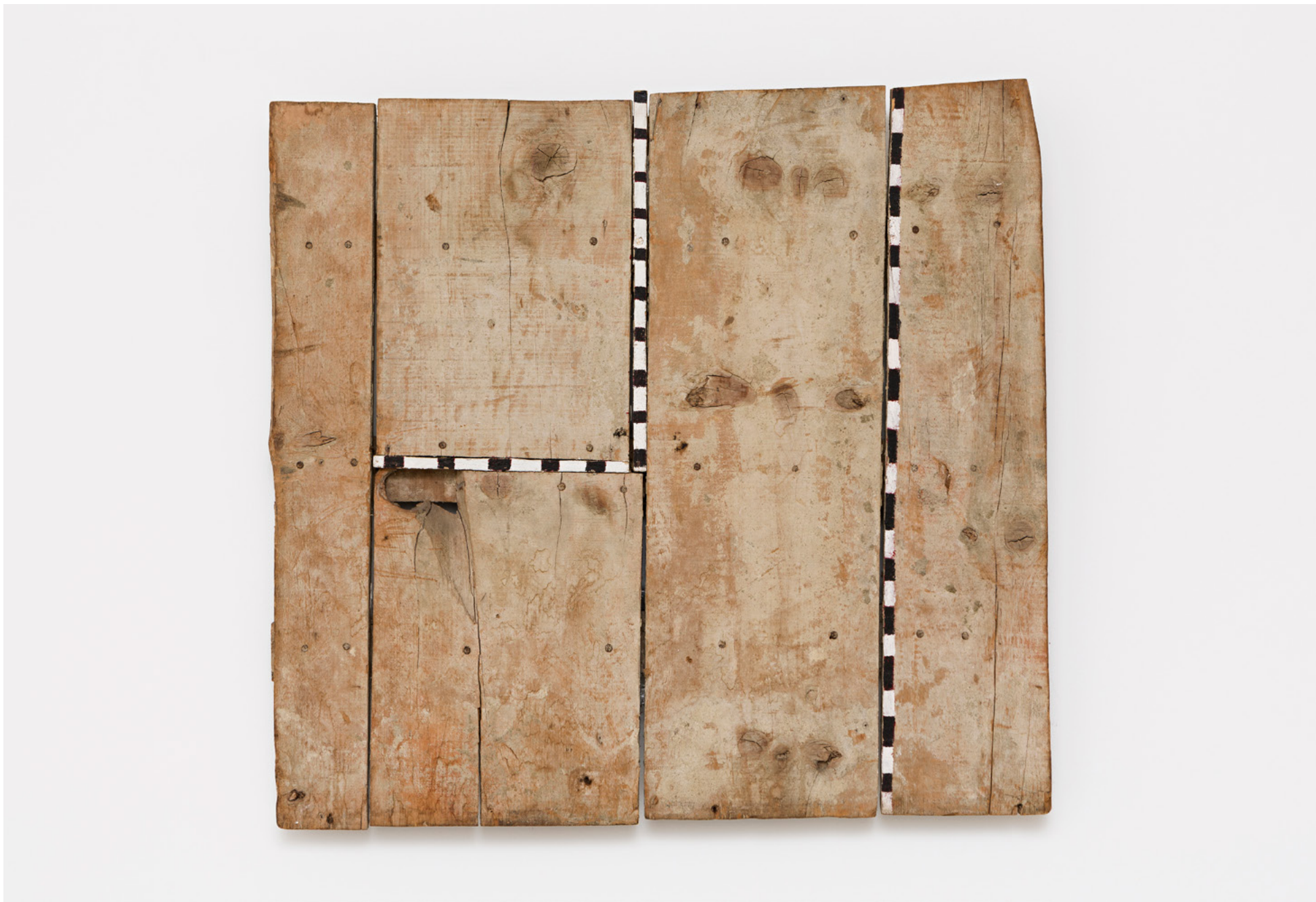
Celso Renato, Untitled , 1985, acrylic on wood, 79 × 85 cm